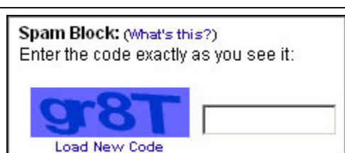
Above: A sample CAPTCHA validation that is used to prevent fraudulent form submissions.

Robert Glennon of CE and Marc Olenzek of AST took steps to implement validation checks to stop this unauthorized activity. One of the validations they implemented is called CAPTCHA. It stands for C ompletely A utomated P ublic T uring test to tell C omputers and H umans A part. It's a type of challenge-response test used to determine that the response is not generated by a computer, thus helping prevent fraudulent form submissions.