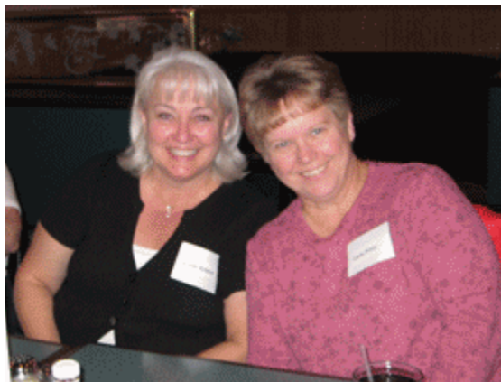
ORS staff joined some of our retired colleagues on October 29 at Tony M's restaurant. View more photos now.