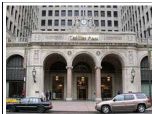
ORS's Detroit Outreach Office is located in the Cadillac Place Building in downtown Detroit.

Sessions are currently limited to a maximum of eight members plus their spouses per session.