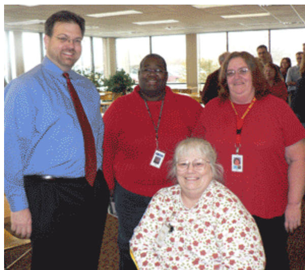
View more photos of ORS holiday fun now.

"It gave us a great feeling of thankfulness that we have jobs and the means to be able to do this for other people."