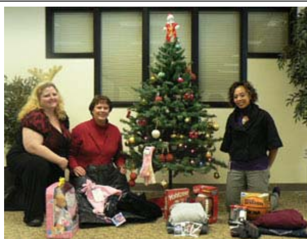
The Insider team members kneel by gifts bought for their St. Vincent adopted family.