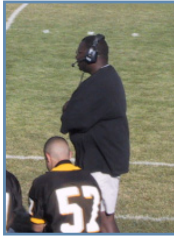
Coach calling the plays.