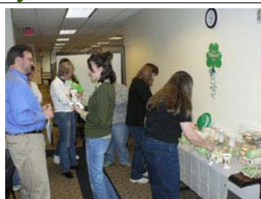
WDRA staff gather to celebrate St. Patrick's Day. A big thank-you goes to EMPAC representatives who provided Irish-cream coffee, hot chocolate, and cookies for this event.

But more importantly, it is a day many Americans celebrate their Irish lineage. The day commemorates St. Patrick, believed to have died on March 17, who introduced Christianity to Ireland in the fifth century. March was proclaimed as Irish-American Heritage Month by Congress in 1995. Each year, the U.S. president issues an Irish-American Heritage Month proclamation.