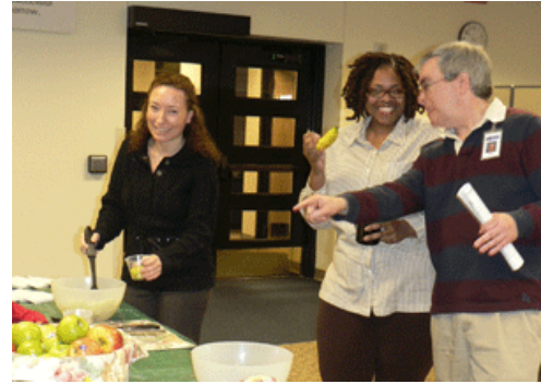
WDRA staff enjoyed apples, oranges, and grapes as they entered wing A. Their healthy mid-morning snack was provided by the HSST.