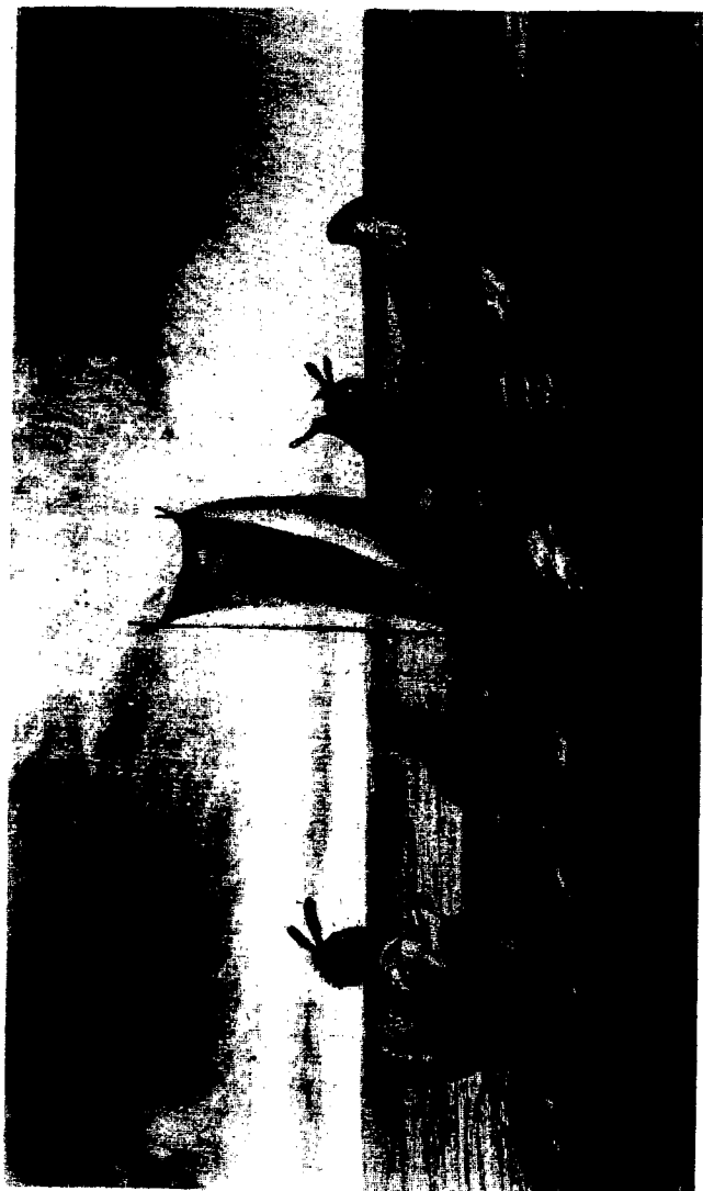
Painting by LT. TIDBALL, U.S.A., in H.R. Schoolcraft, History, Conditions, and Prospects of the Indian Tribes of The United States , vol. 5, facing p. 94.